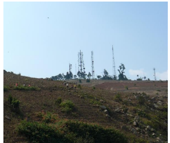
Climbing towards the communications masts at the summit. CPD

Start/Finish: Bangwe /Mpingwe neighbourhoods Distance: 3.5km Elevation Gain: 279m Maximum Elevation: Mt. Mpingwe, 1432m Duration: allow 1.5-2.0 hours Rating: 6/10